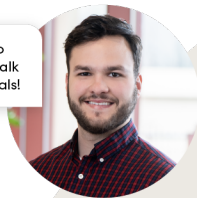
Omada Health Coach

Hi! Welcome to Omada! Let's talk about your goals!