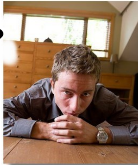
Learn more: www.ptsd.va.gov

Can past traumatic events affect your health today, even if you hardly ever think about them anymore? You may have “moved past” those memories of abuse or assault you experienced years ago, but if perceived as fearful enough—and you may not recall just how much—a type of invisible assault on the brain may have occurred involving stress responses of the amygdala, hippocampus, and pre-frontal cortex. Effects can persist for years, contribute to nightmares, help explain your jumpiness, or perhaps why you’re easily startled, or struggle with vulnerability in relationships. Seven to eight percent of people will experience post-traumatic stress disorder at some point in their lives. The EAP can discuss symptoms, help you decide if PTSD affects you, and locate the right help.